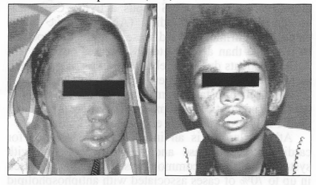
Case 2 Case 3 Figs 5 & 6- Malar, butterfly and discoid rash in case 2 and 3

Laboratory investigations didn't show evidence of renal or haematological disorders. Serum antiphospholipid was normal and serum anti double stranded DNA was high; 305 in case 2 and 452u/ml in case 3 (N<117u/ml), Serum ANA and Anti-smooth muscle antibodies were positive (>15) in both cases.