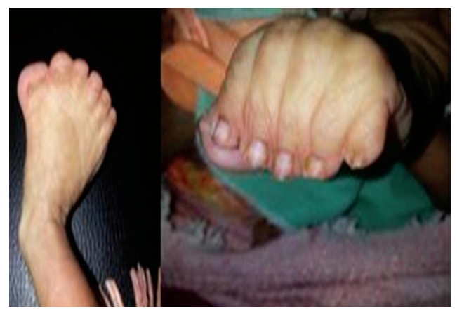
Figure 2 - polydactyly and syndactyly of the hands and feet

The diagnosis of Apert syndrome was made on clinical grounds and ophthalmological assessment revealed bilateral optic atrophy with complete blindness, whereas hearing assessment was normal as well as echocardiography. A three- dimensional CT brain scan with reconstruction showed craniosynostosis and brachycephaly with multiple skull defects (Figure 3A). The CT also showed generalized brain atrophy with multiple extra axial cystic lesions (Figure 3B). All these findings were in favor of Apert syndrome. Plain X ray of the hands and feet showed osseous syndactyly.