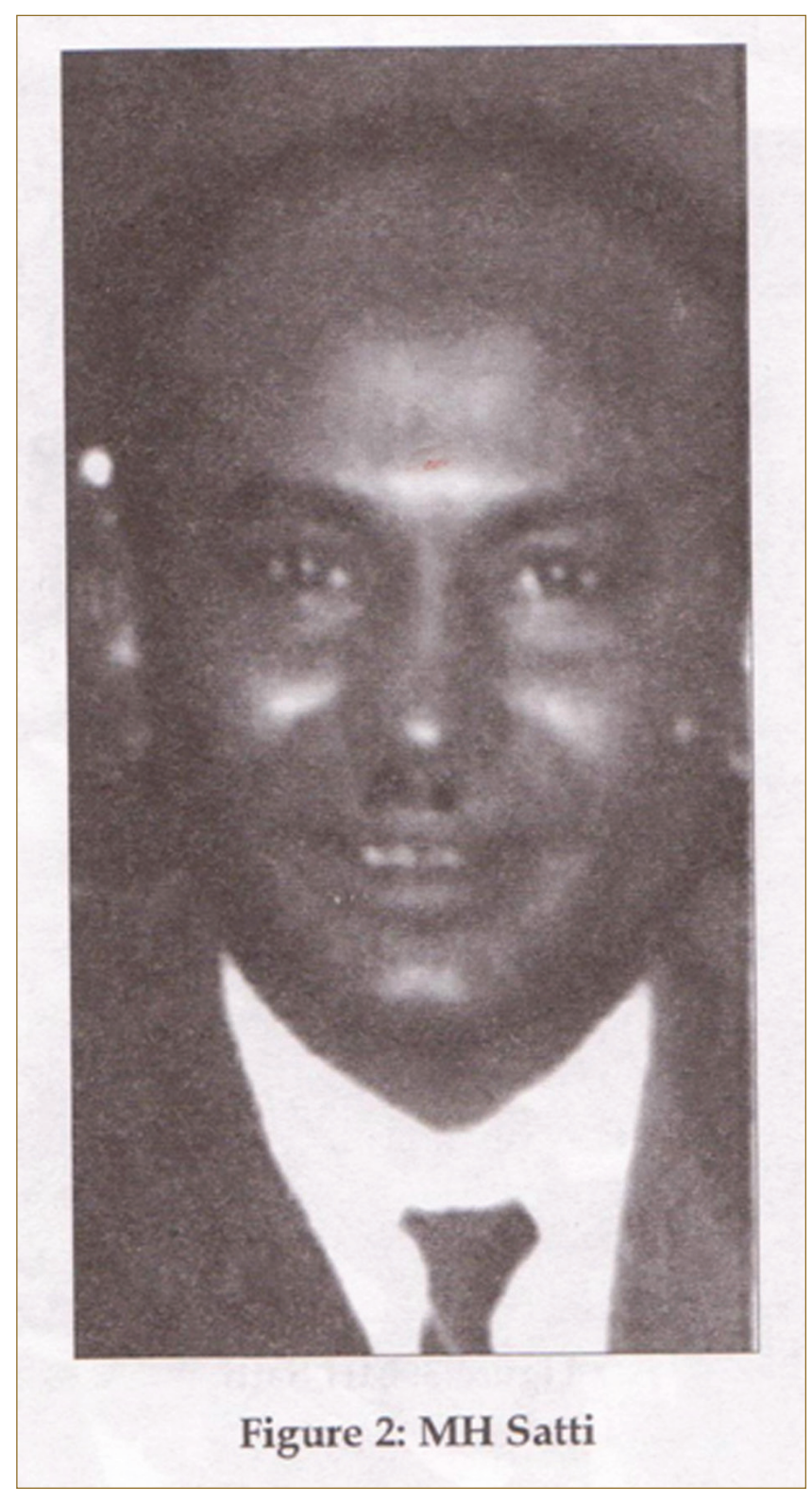
Photo 3 (Book Figure 2): This photo was probably taken in London between 1952 and 1954.