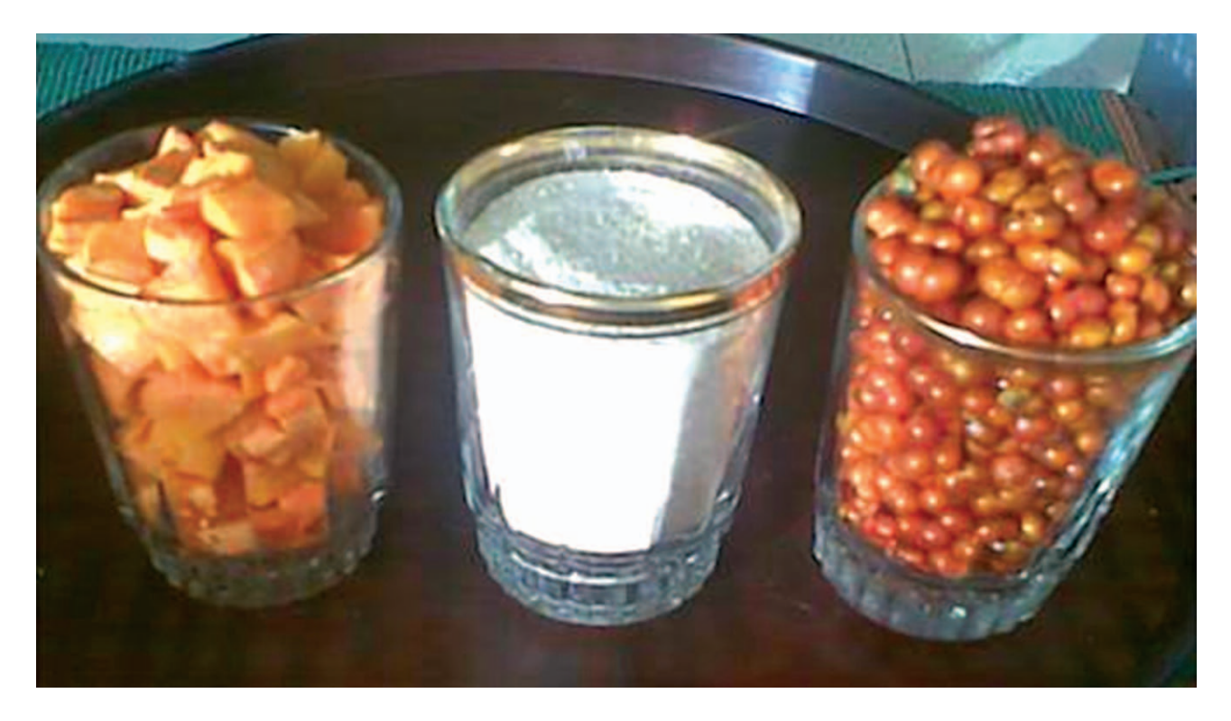
Figure 1 - Carbaodeim volume measures used in the study

Carbaodeim is a natural hematinic blend, which is formed of carrots, baobab (Adansonia digitata) and godiem (Grewia tenax) and proved to have high content of iron, folic acid, vitamin C and protein. Carrot is a root vegetable that can be eaten fresh or cocked (Figure 1). It contains high levels of vitamins A, C, K and folic acid (Table 1) [8]. Baobab (Adansonia digitata) is a dry fruit that has an ovoid shell with a white pulp enclosed within hard fibrous locules. Locally, it is called Gonglaize and Tabaldi. The tree Adansonia digitata, has a huge and capacious stem. Boabab has a high level of calcium, phosphorous, potassium, iron, ascorbic acid and thiamine [9].