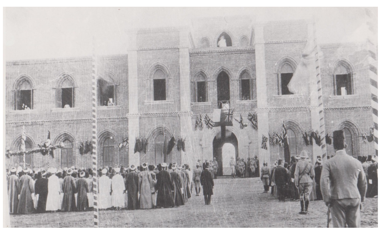
Figure 1 - Inauguration of the Gordon Memorial College, 8 November, 1902.

The Gordon Memorial College had already been officially opened on November 8th 1902 (Figure 1), but finishing of the laboratories and fitting the furniture and equipment was pending his arrival.